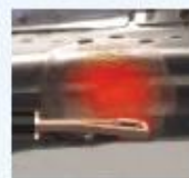
Side member heating