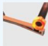
Releasing of rusted bolts