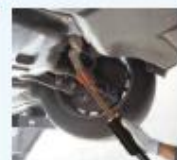
Releasing of steering linkage